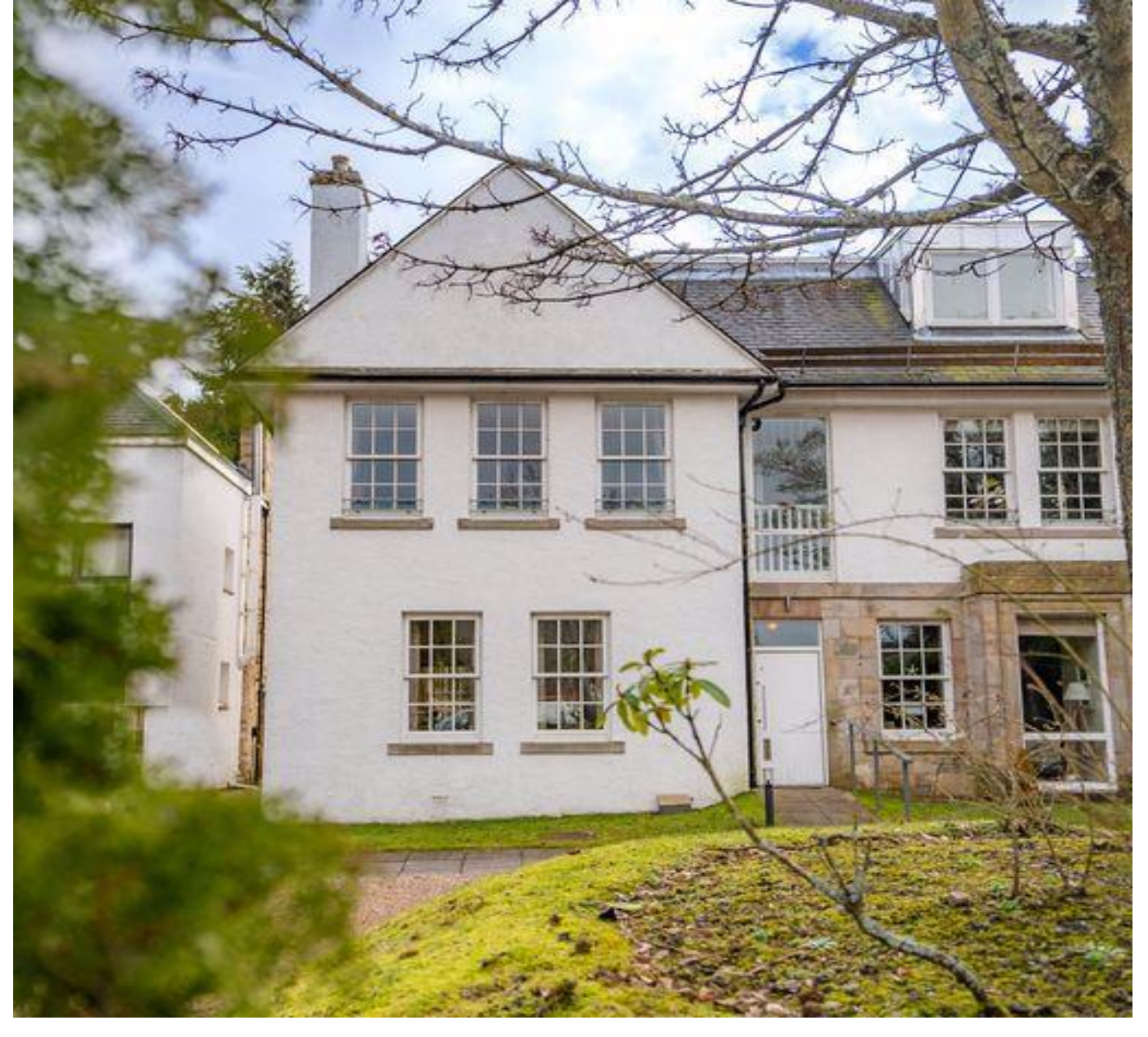
4 Ravelrig Drive, Balerno, Edinburgh, EH14 7NQ